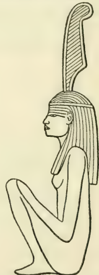
THE GODDESS MAAT. From Budge's Mummy , p. 29.

uppermost in the minds of the Egyptian people. She is also spoken of in the dual form ma'ati , "the two truths,"